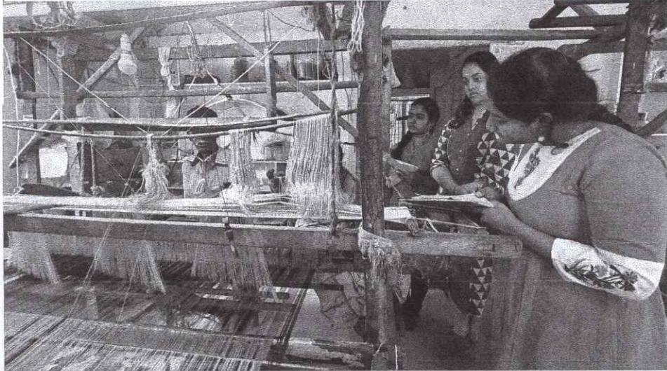
Figure 4 Kuppadam Sarees