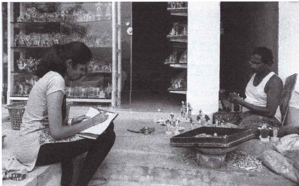
Figure 1 Kondapalli Bommalu

Conclusion: The exploration of Andhra handicraft villages has been a transformative learning experience for the students, offering profound insights into the intersection of architecture, handicrafts, and community life. The documentation and analysis conducted during the visit lay a solid foundation for the "Art and Craft Village Design" project, poised to create inclusive and vibrant spaces that celebrate the rich heritage of Andhra handicrafts.