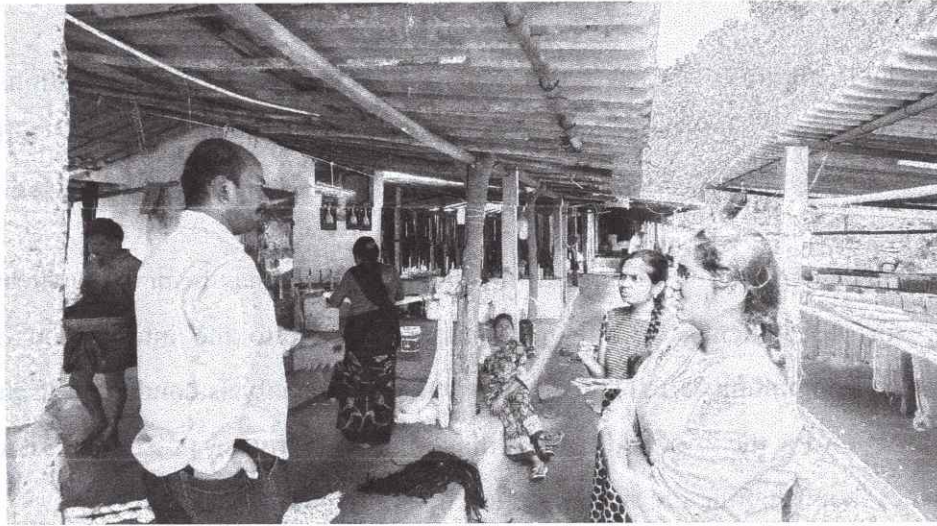
Figure 3 Uppada Sarees