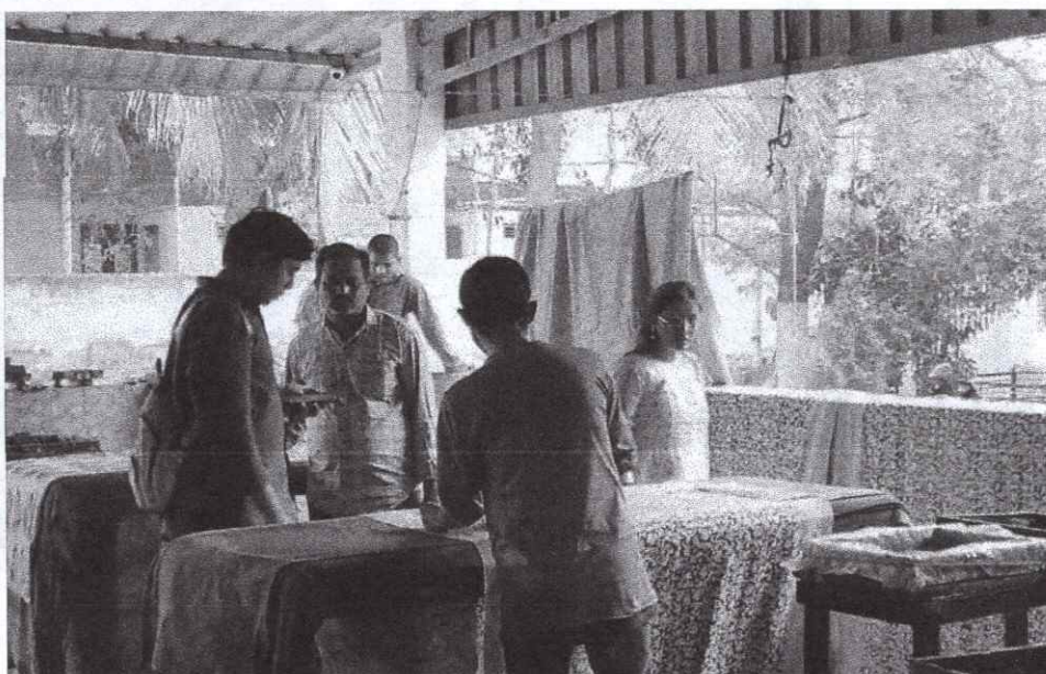
Figure 2 - Kalamkari Block Prints